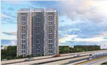
OPUS Tumkur Road, Bengaluru