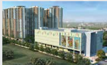
DIVINITY Mysore Road, Bengaluru