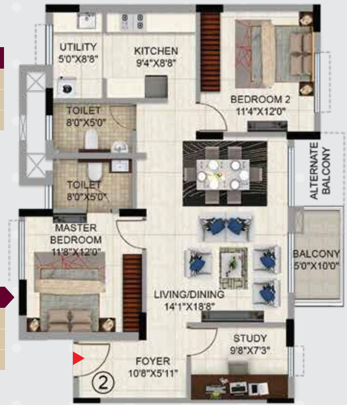
UNIT 2 - BLOCK B - WING 3 SQM. SFT.