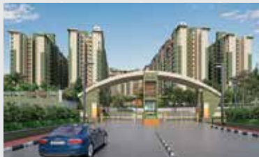
ANUGRAHA Magadi Main Road, Bengaluru