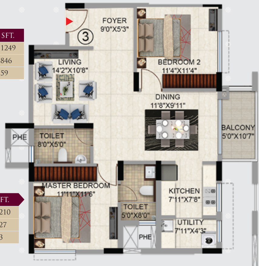
UNIT 3 - BLOCK B - WING 3 SQM. SFT.