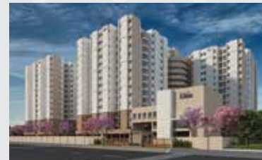
ASHRAYA Mysore Road, Bidadi