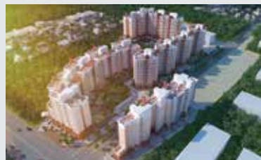
HM ROYAL Kondhwa (opposite Talab factory), Pune