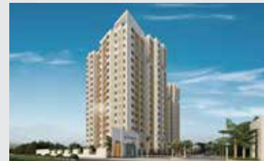
SIGNET Sarjapur, Bengaluru