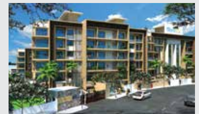
WATER'S EDGE Sancoale, Goa