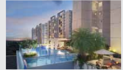
MISTY CHARM Off Kanakapura Road, Bengaluru