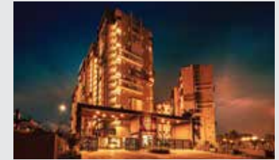
EAST CREST Near Budigere Cross, Bengaluru