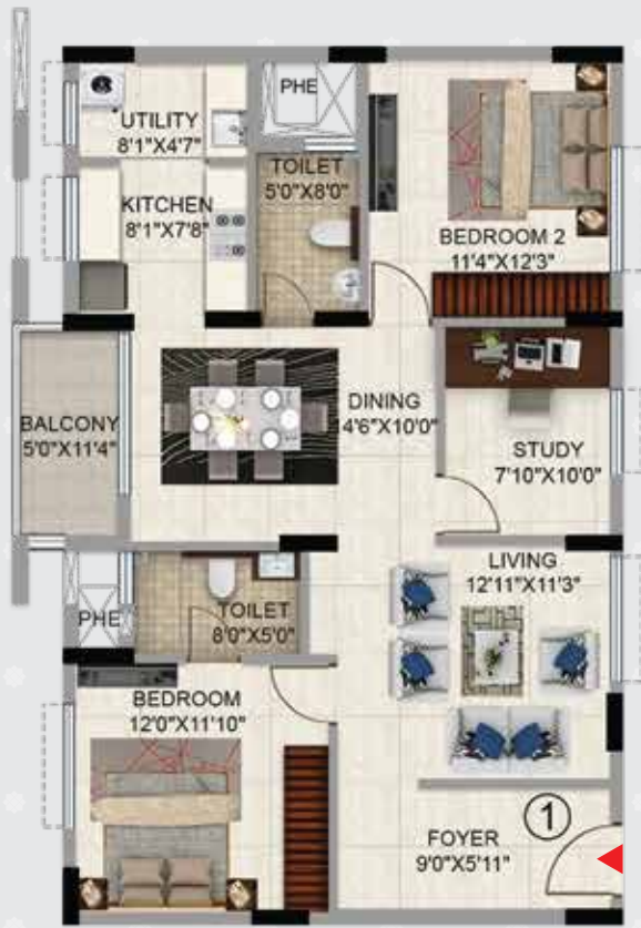
UNIT 1 - BLOCK B - WING 3 SQM. SFT.