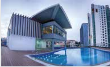
MAGNIFICIA Old Madras Road, Bengaluru