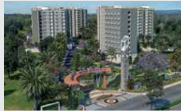
AEROPOLIS NH 44, Bengaluru