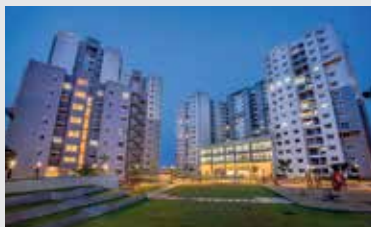
LAUREL HEIGHTS Hesaraghatta Main Road, Bengaluru