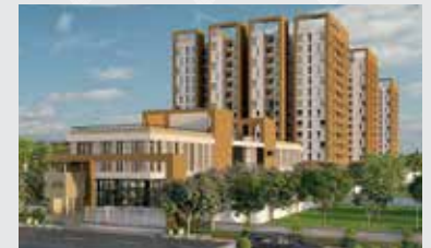
EXOTIC Bagalur Main Road, Bengaluru