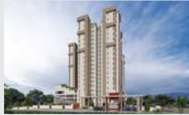
AQUA VISTA Bannerghatta Main Rd., Bengaluru