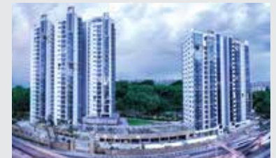
LUXURIA Malleshwaram, Bengaluru