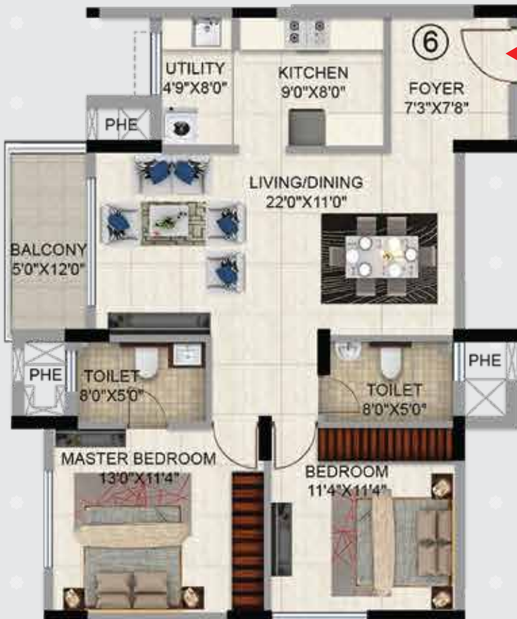
UNIT 6 - BLOCK B - WING 3 SQM. SFT.