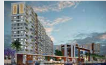
PARK CUBIX Devanahalli, Bengaluru