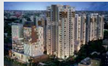
MAGNUS Shaikpet, Hyderabad