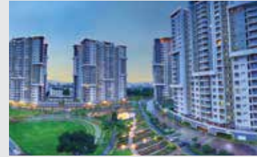
GREENAGE Hosur Main Road, Bengaluru