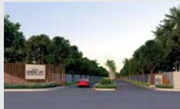
SERENE LIFE Shettigere, Bengaluru